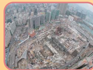
在施工期間帶來的交通及社會影響 Traffic and Social Impacts during Construction Stage