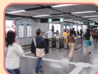
與現有地下設施的連接 (包括地庫、港鐵站及隧道等) Interface with Existing Underground Uses including Basements, MTR Stations and Tunnels