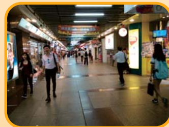
台北地下購物街 TAIPEI UNDERGROUND SHOPPING STREET