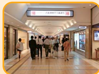
東京、大阪及名古屋地下購物街 TOKYO, OSAKA & NAGOYA UNDERGROUND SHOPPING STREETS