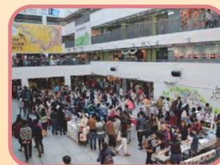
執行安排 Implementation Arrangement