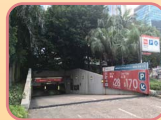
地下空間發展對地面設施/ 活動的影響 Impact to Above-ground Facilities/Activities