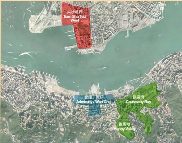
四個策略性地區 The Four Strategic Urban Areas

初步規劃概念 - 九龍公園地下空間 Preliminary Planning Concepts - Underground Space beneath Kowloon Park