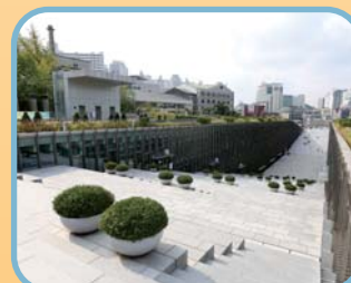
首爾梨花女子大學 EWHA WOMANS UNIVERSITY, SEOUL