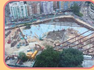
財務可行性：建設、營運和 保養成本及投資回報期 Financial Viability: Construction, Operation and Maintenance Costs and Recovery Period