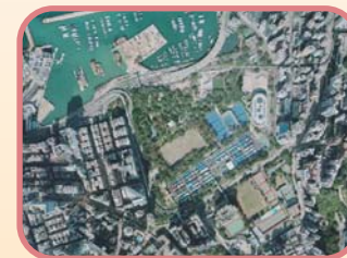
業權及城市規劃事宜 Land Ownership and Town Planning Issues