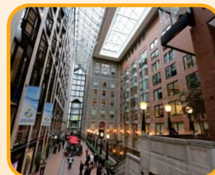
蒙特利爾地下城 MONTRÉAL UNDERGROUND CITY