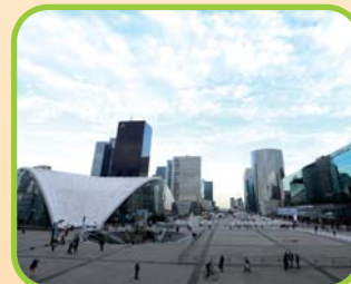
巴黎拉德芳斯商業區 BUSINESS DISTRICT OF LA DÉFENSE, PARIS