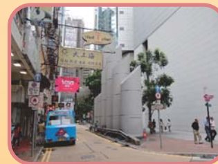
消防安全 Fire Safety