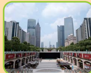
廣州市珠江新城花城匯 MALL OF THE WORLD, ZHUJIANG NEW TOWN, GUANGZHOU