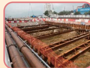
土力、結構和基礎設施的限制 Geotechnical, Structural and Infrastructural Constraints